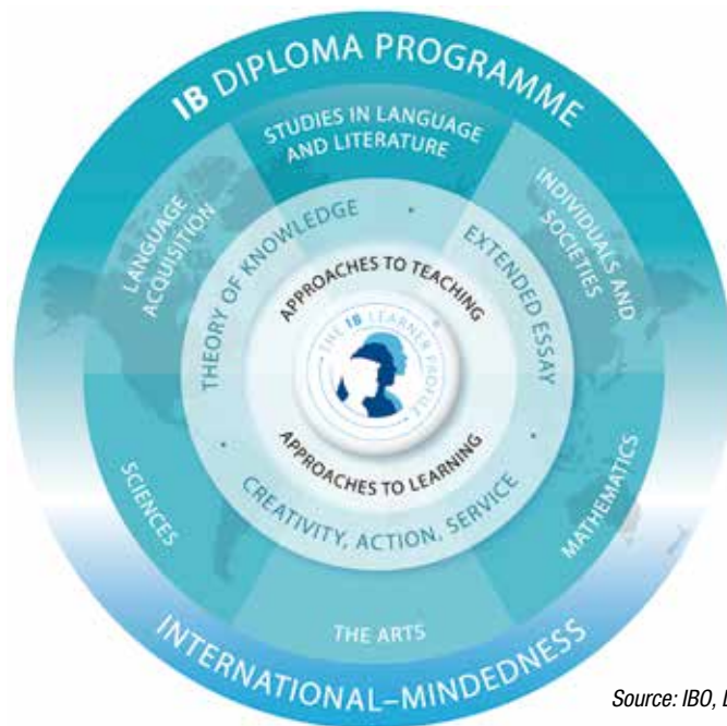
Source: IBO, Diploma Programme Curriculum Framework

Students also have to complete three components which are central to the IBDP – Theory of Knowledge (TOK), Creativity, Activity and Service (CAS) and Extended Essay (EE).